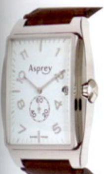
watch by ASPREY