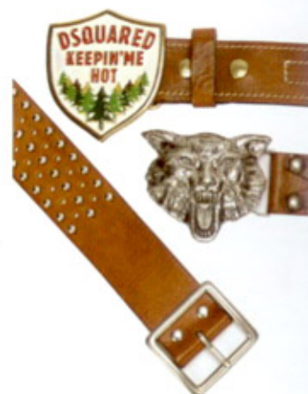
belt by DSQUARED