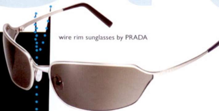
wire rim sunglasses by PRADA