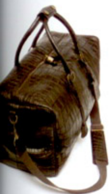
weekender by DOLCE & GABBANA

runway shot by DOLCE & GABBANA courtesy of Neiman Marcus