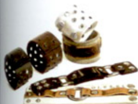
leather cuff by DIESEL