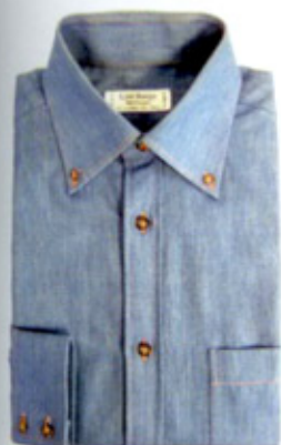
denim shirt by LISTE ROUGE-PARIS