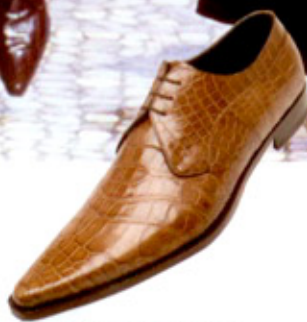
pointed lace up by DOLCE & GABBANA