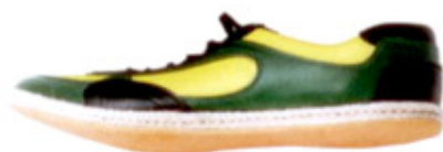
style sneaker by PRADA