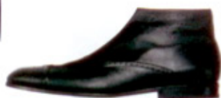
leather dress shoe by PRADA