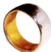
band by PHILIP CRANGI