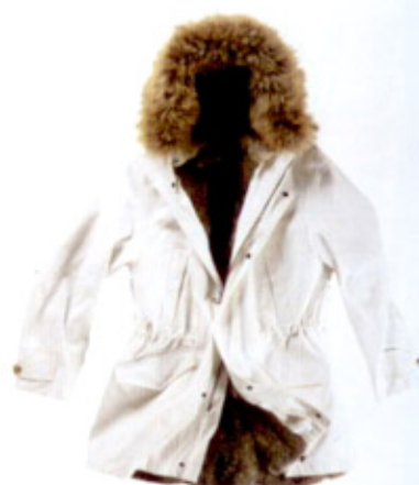
fur lined coat by MALO