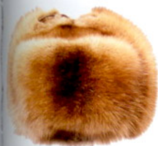
Fur trapper hat by J. MENDEL