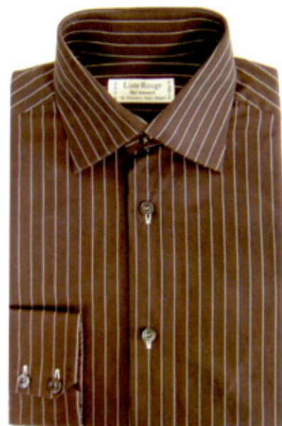
pinstripe button up by LISTE ROUGE-PARIS